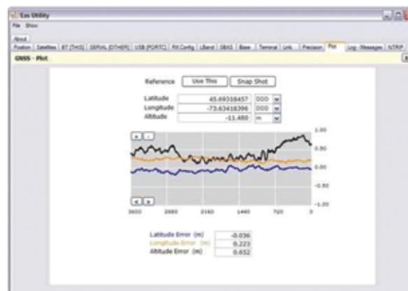
Actual (true) accuracy in Eos Utility over a 1 hour period (Arrow 100 using WAAS)