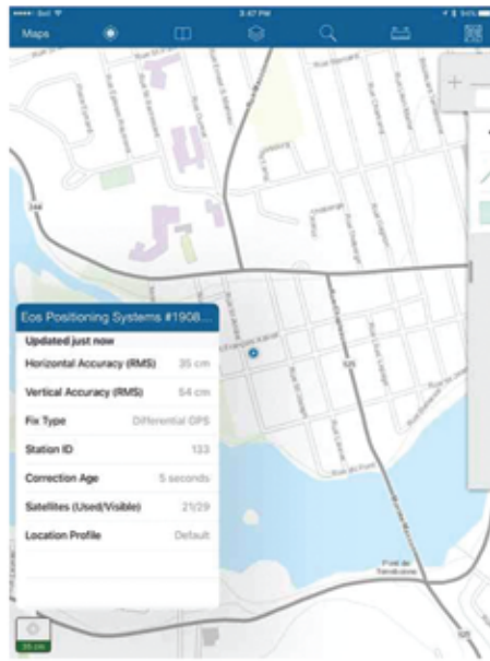
Estimated accuracies and GNSS metadata in Esri's Collector (Arrow 100 using WAAS)

Without the estimated GNSS accuracy being displayed on the screen in your mapping app, you are “flying blind”. However, all is not lost. You can run our Eos Tools Pro software in iOS or Android in conjunction with your mapping app and it will allow you to set an alarm so it warns you if you attempt to collect data that doesn't meet certain accuracy requirements. It's not as an efficient solution, but you can get the job done.