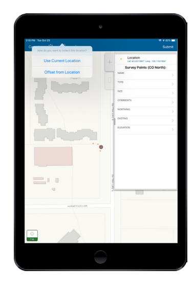
Eos Positioning Systems released "Eos Laser Mapping™ for ArcGIS" in 2018. It allows DDSI to map utilities with subfoot accuracy without having to physically occupy the points, such as in GNSS-impaired environments. The result means far less manual work and fewer site revisits.

"Going back to a site twice is essentially a job killer," George said. "Everything for us needs to happen in one day. The difference between having to survey a site once, or twice, is often the difference between making a project profitable or breaking even."