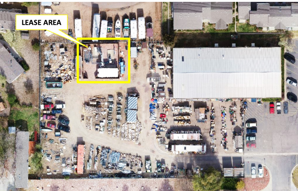
DDSI conducts site surveys to help architecture and engineering firms identify opportunities to expand telecommunication footprints. Their projects include mapping all underground utilities with a required subfoot accuracy. But at any given site, the field mapping conditions are unknown until the crew arrives.